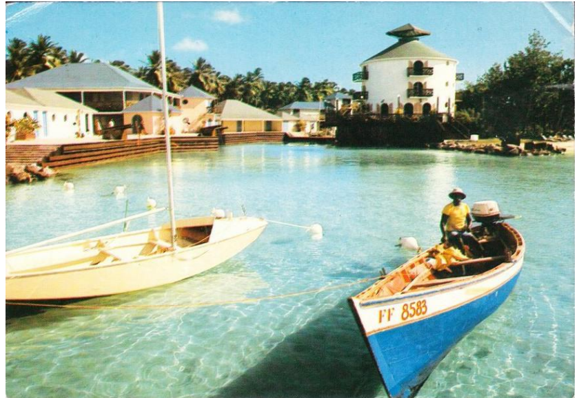
View side of the vacation post card

Although the island of Antigua, where most citizens live, was spared a direct hit from Hurricane Irma in September 2017, the smaller island of Barbuda 25 miles north was not. It was in the eyewall of the Category 5 hurricane at its near peak intensity. With nearly 95% of its structures damaged or destroyed by flattening or flooding (including the only two hotels), the island was virtually uninhabitable and the citizens were evacuated to Antigua. Now reconstruction is underway, but recent photos from Google Maps still show extensive destruction and very few inhabitants in Codrington, Barbuda’s only town. However, when viewed from the skies the islands of Antigua and Barbuda are gems.