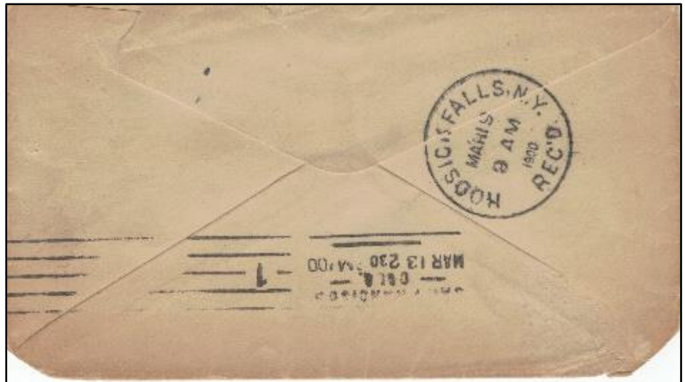
Address side of cover postmarked Honolulu, HI, March 5, 1900 to New York. Reverse side of cover with transit postmark March 13, 1900 and receiving postmark in Hoosick Falls, NY on March 19, 1900. Notice the clipped corners.

Reference: Post Office In Paradise, www.hawaiianstamps.com , Fumigated Mail and Other Epidemic Mail Covers.