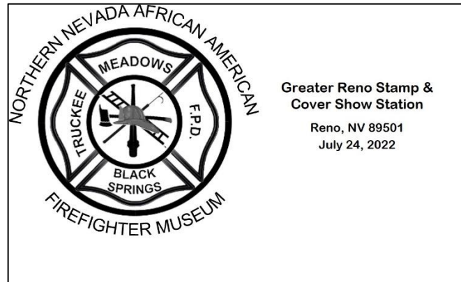
July 24 Pictorial Show Cancel.

Before arriving at the show, consider some tips for a successful show visit: Create a want list. Pack a pair of tongs. Set your budget and stick to it. You want to avoid buyer's remorse. Be prepared to convey to the dealer your collecting standards, i.e., mint, NH, used, F-VF, VF, superb, graded, etc. Let the dealer know what kind of material you are looking for. If the dealer doesn't have it in stock, they may be able to watch for it and contact you if the item appears. Bring your checkbook and some cash, since not all dealers accept credit cards. Don't forget to wear your club name tag. The dealers do notice, and you can always ask for a discount as a club member. You also may consider contacting the dealer ahead of time to see if they can bring something specific. Many dealers have large inventories, and they cannot bring everything to the show. If you click on the show page at https://renostamp.org/show.html , you will find a diagram of the dealer table placements and a list of the dealers with emails.