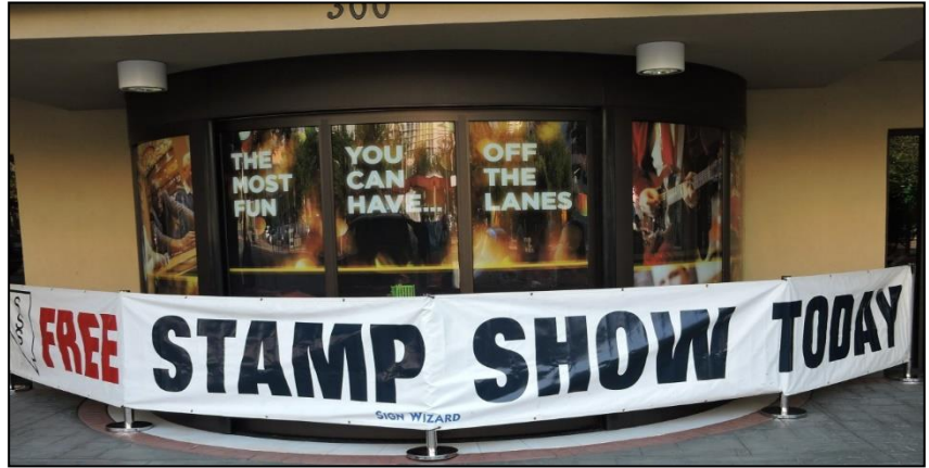
Entrance to the Bowling Stadium with our show

On July 23 and 24 the Nevada Stamp Study Society is hosting the 2022 Greater Reno Stamp & Cover Show. Once again, it will be held in the Hall of Fame Museum on the first floor of the National Bowling Stadium. It is located at 300 North Center Street with free parking in the stadium garage. Show hours are 10 a.m. to 6 p.m. on Saturday and 10 a.m. to 4 p.m. on Sunday.